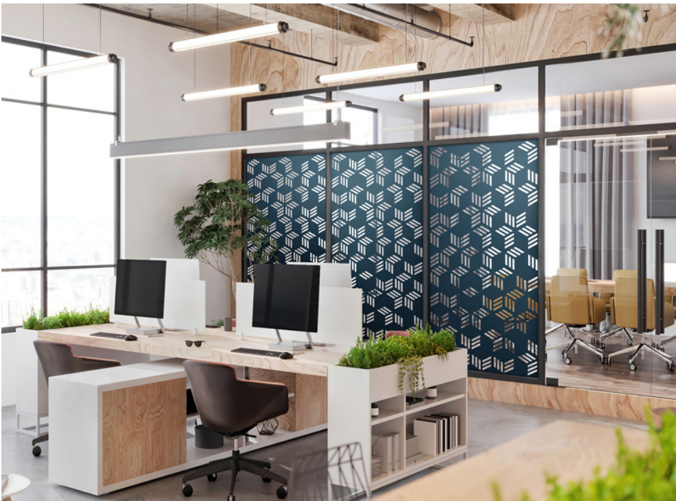
Colorful Transparency panels can be used as privacy screens in the office.