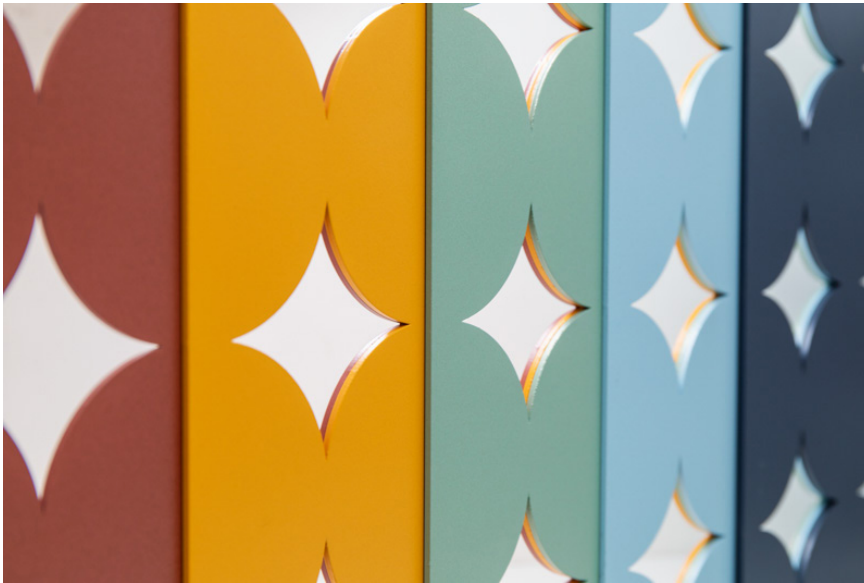
Laser-cut and powder-coated on aluminum sheets, Transparency is the latest addition to the Surface Mode line.