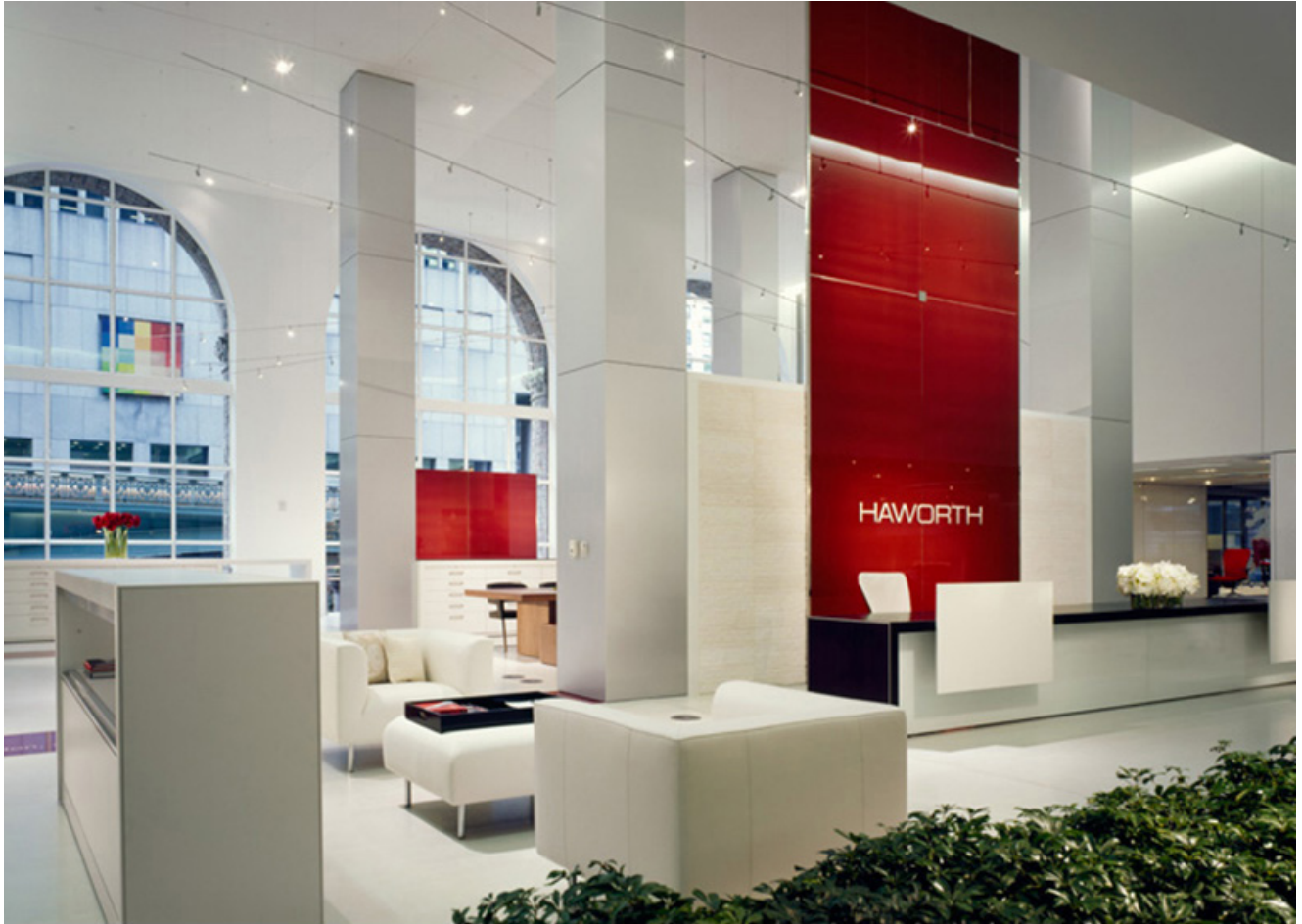
Chemetal's HPL in Satin Silver adorns columns in a Haworth showroom.